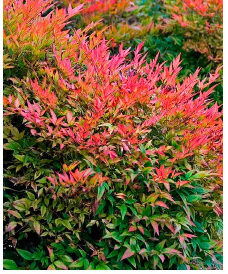
The "Gulfstream" nandina , with small leaves on horizontal branches, is especially distinctive in shady areas. There are many versions of nandina to use in a shady landscape. The standard version reaches 7 feet tall and has attractive berries and colorful winter foliage depending on how much sun it receives.

First, determine your shade conditions. From partial to dappled to deep shade, each situation and the hours of sunlight a site gets each day should guide your plant choices.