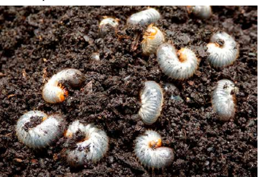
You can't see them but they killed these grubs. Beneficial nematodes are microscopic soil worms that can be purchased at Milberger's Nursery and watered into the lawn to attack white grubs, flea larvae, fungus gnats and other insects (like termites) in the soil. They are harmless to humans, plants and pets. Nematodes are a living organism and must be treated with care by keeping them out of sunlight and extreme heat.

For container plants, mix the recommended amount of nematodes with a gallon of water and water them into the potting soil. Only water container plants when the soil is dry down to about 1 inch deep.