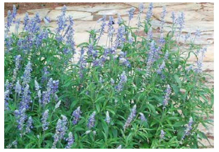
Mealy-cup or blue sage is a South and Central Texas native with spikes of blue flowers that bloom all summer, growing about 3 feet tall. Like many salvias, it looks best if cut back once or twice during the summer.

The genus Salvia probably got its common name "sage" from the Mediterranean herb Salvia officinalis, known the world over for its medicinal and culinary values.