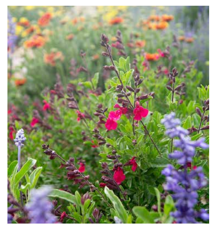
While blue is the predominant color in the species salvias come in a wide range of colors like the Autumn sage (Salvia greggii) shown here behind the blue Mealy-cup salvia. Autumn sage is really misnamed because it blooms spring through fall. While most perennial salvias are herbaceous perennials, freezing to the ground each winter and returning from the roots, Autumn sage is partly evergreen and semi-woody. Autumn sage needs full sun and excellent drainage to do best, and is very drought tolerant. Flowers colors include the most common red form, plus white, pink, rose, purple and orange.

Milberger's new butterfly garden has been certified by the North American Butterfly Association. Stop by and see exactly how you can transform a portion of your landscape into a beautiful haven for butterflies and hummingbirds. You can also find our weekly sale items on our web site at www.milbergernursery.com .