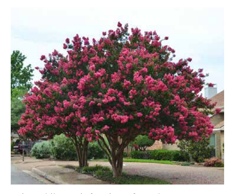
point, while a pair framing a front door greets visitors with a warm Southern welcome.

Crepe myrtles have many landscape uses. Planted together, they make a large deciduous hedge or screen. A single tree can create a distinctive focal