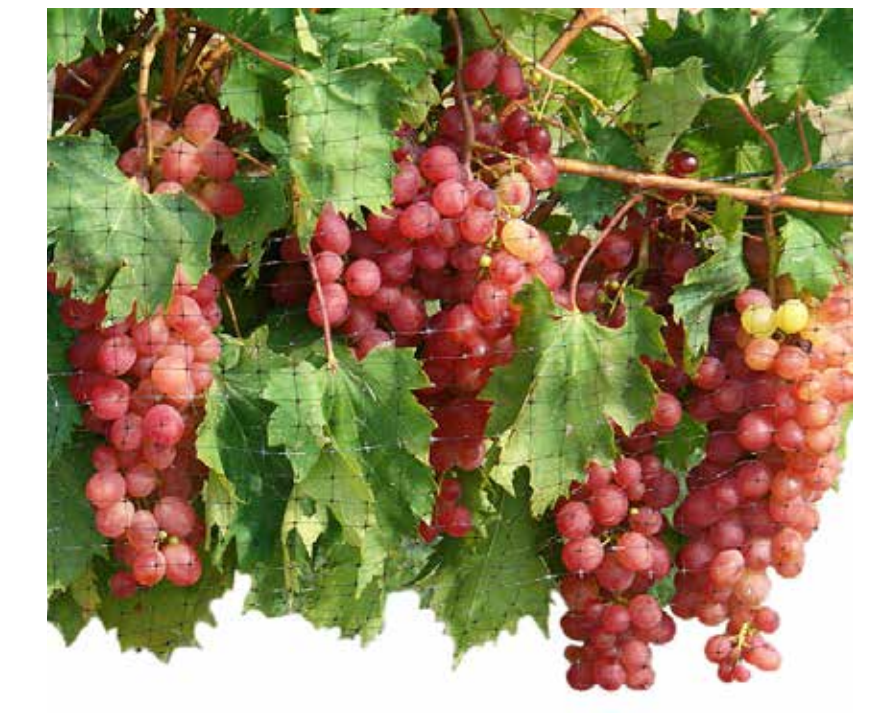
The most significant characteristic of Victoria Red is its sustained health. vigor and productivity in the coastal area of Texas, which has extremely high Pierce's disease pressure.

seeded grape with both large berries and clusters that are attractive and long with a bright red skin color, according to the Texas Superstar promotion literature. Average cluster weights at Tarkington Vineyards exceeded one pound.